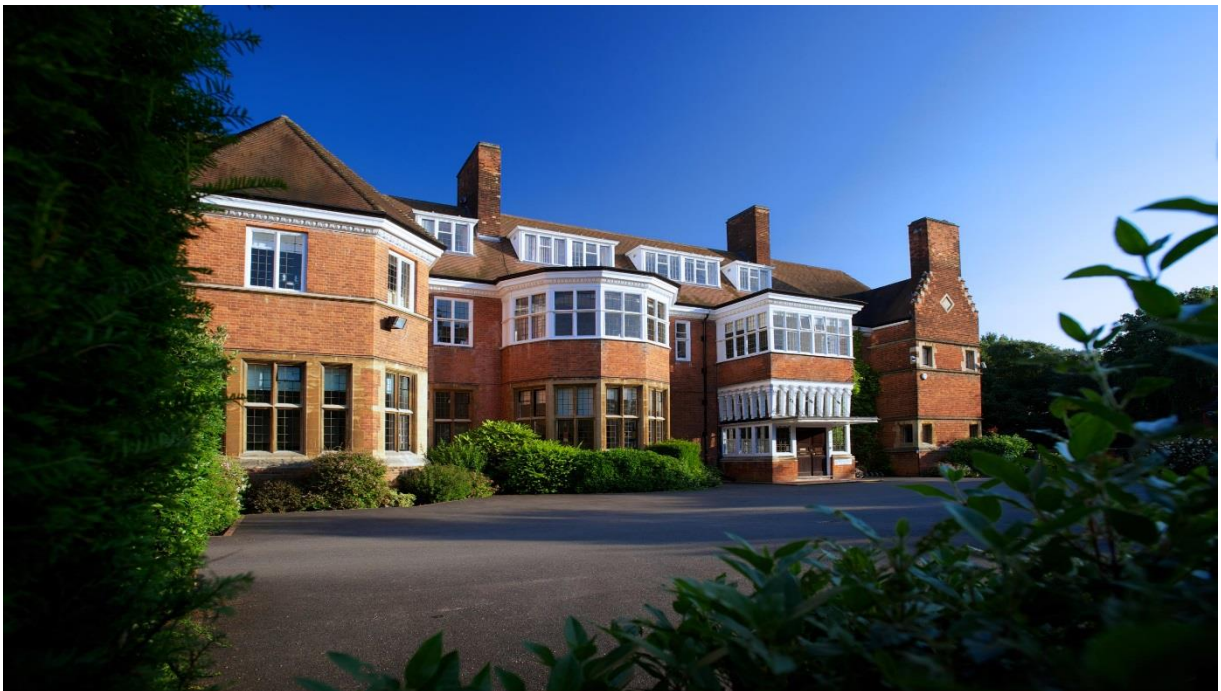
Bullers Wood House

Closing date - Monday, 22 nd January 2018 - 9.00am