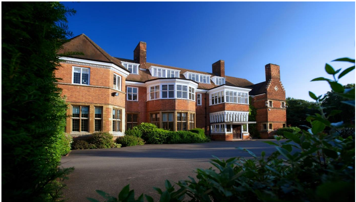
Bullers Wood House

Closing date - Monday, 14 th January 2019 - 9.00am