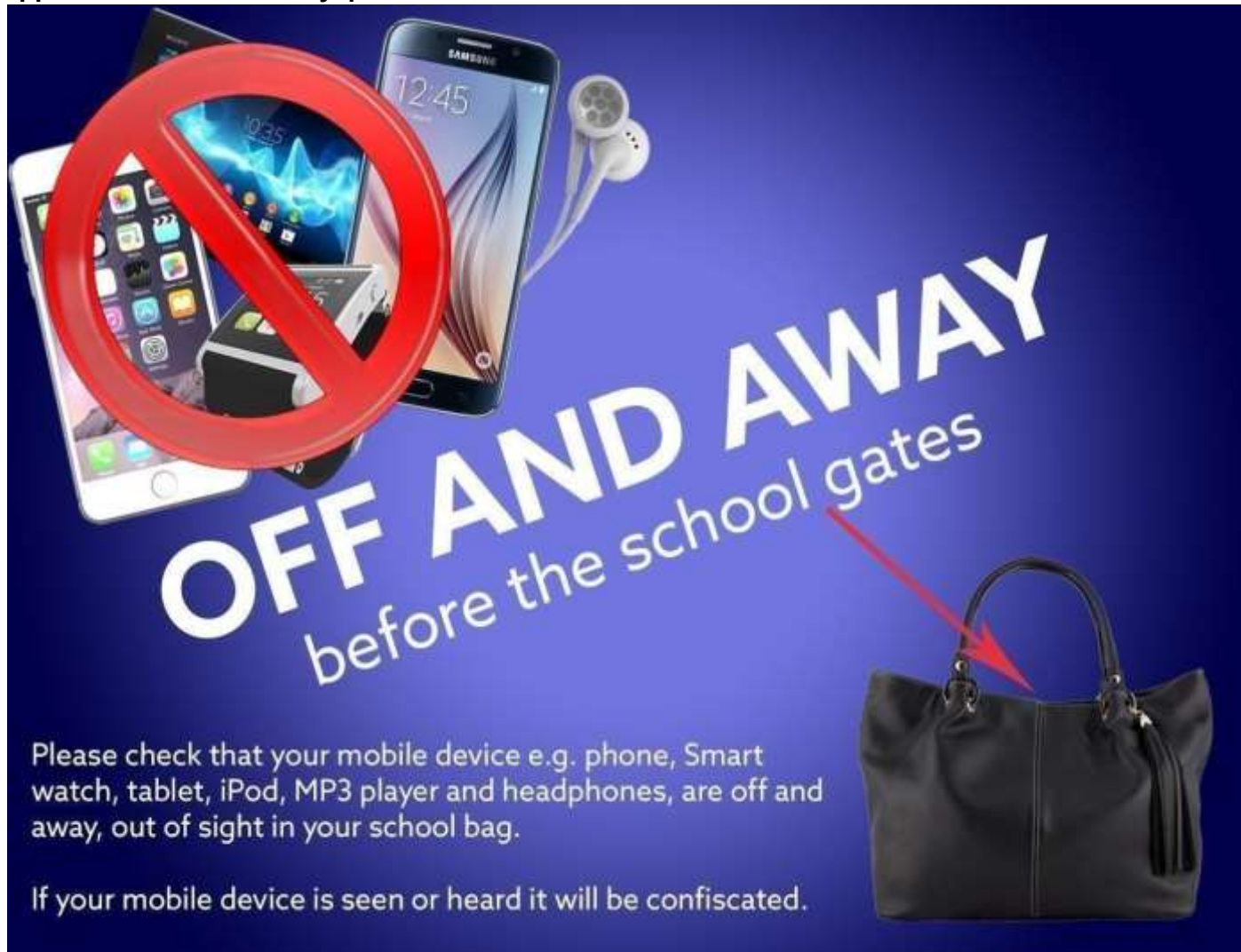
Appendix 9 - 'Off and away' poster